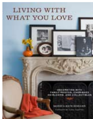
Published by Clarkson Potter.

The Kyrelos Chaise Lounge, made of solid mahogany, has a softly shaded wood tone and a hand-rubbed-lacquer finish. For more Therien product information, visit therien.com .