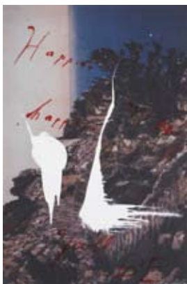
Artist: Julian Schnabel.